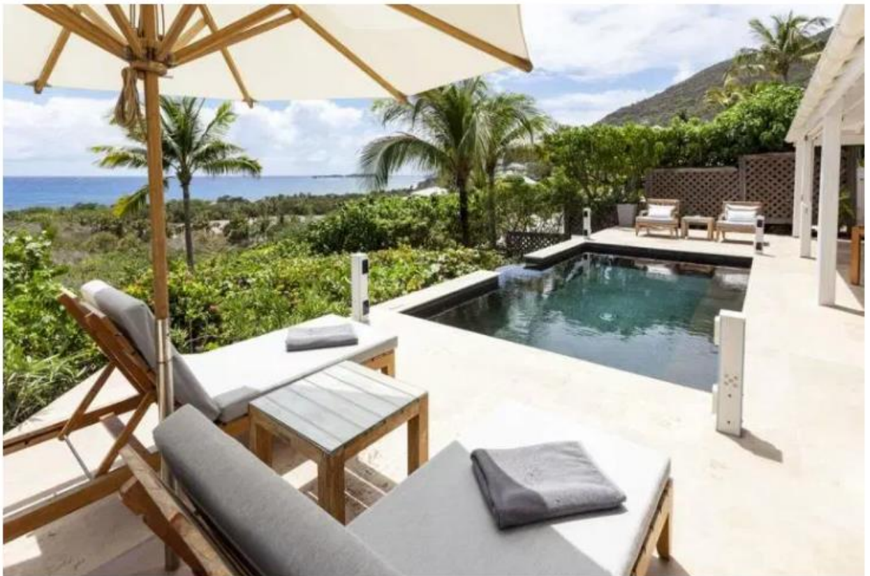
Hotel Le Toiny