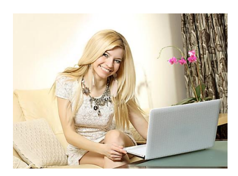
Getting an Online Job in USA might be easier than you Work From Home | Sponsored ads (https://6651d8.nmptrkgqczwgnrb. com?

network=outbrain&site=$publish er_name$_$section_name$&adti tle=Getting+an+Online+Job+in+U SA+might+be+easier+than+you+t hink&subid1=$time_stamp$&sub id2=005cccf7c4ec1a22ee651ee56db e511cb2&subid3=$publisher_id$_ $section_id$&subid4=Getting+an +Online+Job+in+USA+might+be+ easier+than+you+think&outbrain clickid=$ob_click_id$&dpco=1&o bOrigUrl=true)