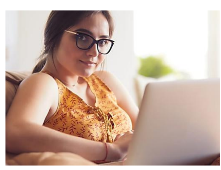
Online Jobs in the USA May Pay More Than You Think Online Jobs | Search Ads (https://abo593.nmptrkgqczwgnrb. com?

network=outbrain&site=$publish er_name$_$section_name$&adti tle=Getting+an+Online+Job+in+U SA+might+be+easier+than+you+t hink&subid1=$time_stamp$&sub id2=005cccf7c4ec1a22ee651ee56db e511cb2&subid3=$publisher_id$_ $section_id$&subid4=Getting+an +Online+Job+in+USA+might+be+ easier+than+you+think&outbrain clickid=$ob_click_id$&dpco=1&o bOrigUrl=true)