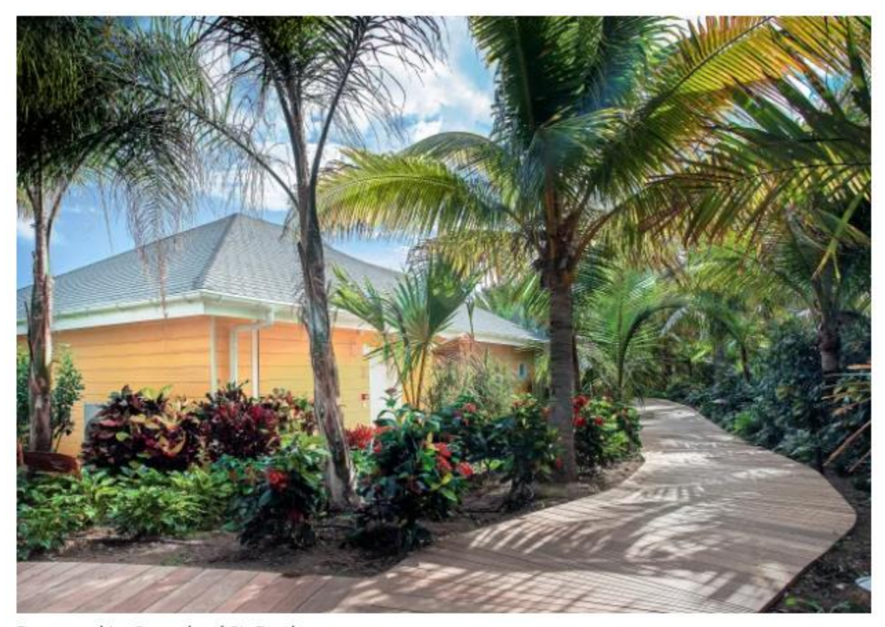
Rosewood Le Guanahani St. Barth.