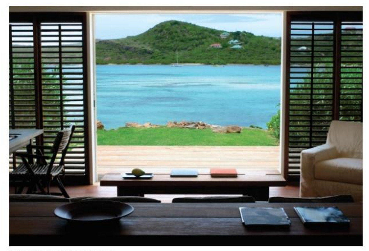
Le Sereno.