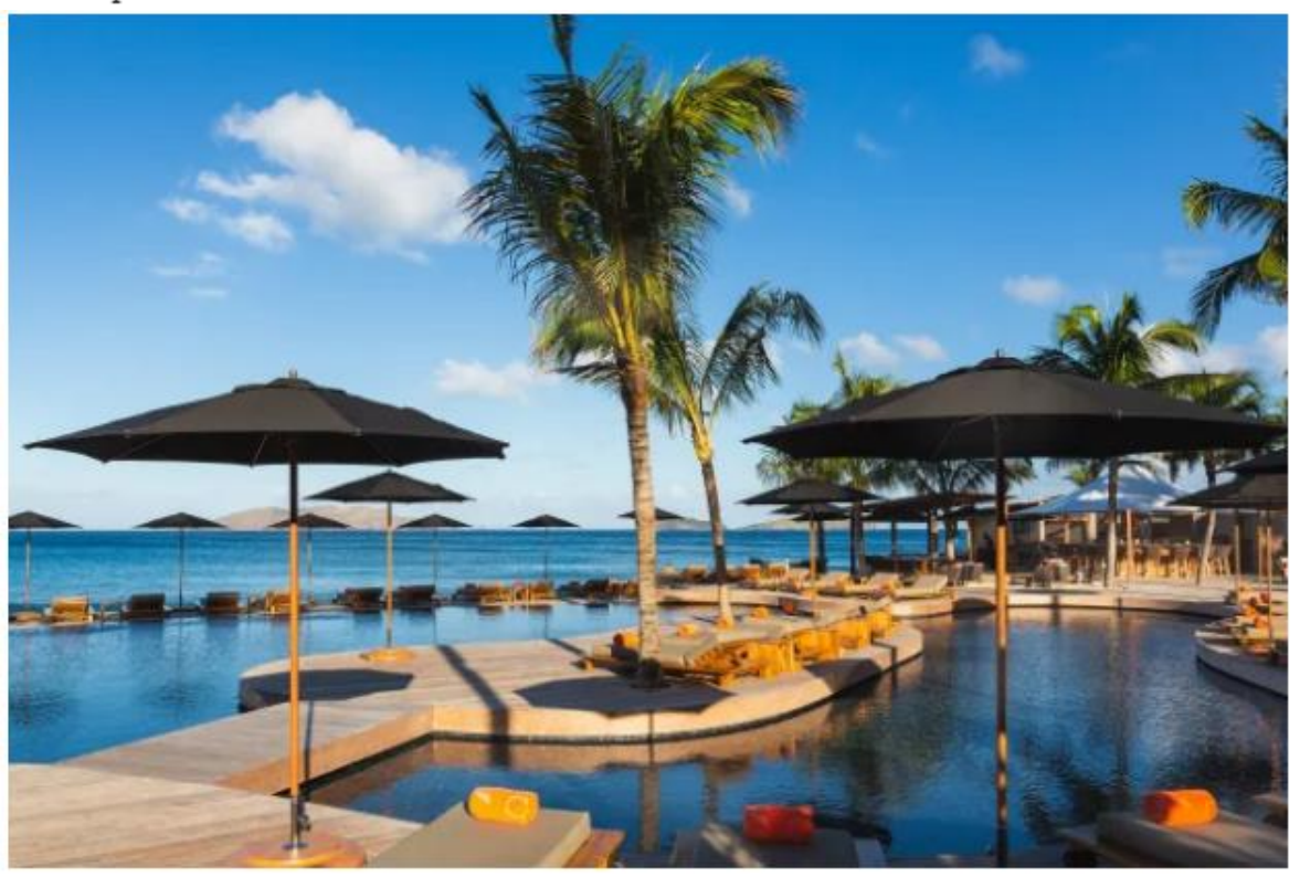
Hotel Christopher.

You don't have to be a foodie to appreciate the <u>cuisine</u> and scenery of the picturesque <u>Caribbean island</u>, of course, and November happens to be one of the loveliest times to travel to Saint Barthélemy, since it's just before the hectic tourist season. If you're considering a trip to the dreamy destination this year (even if it's not for the Gourmet Festival), you'll want to book a stay at one of the island's most unique and luxurious hotels. While there's no shortage of glamorous accommodations in St. Barth, certain spots always manage to stand out. Below, see seven of the best hotels to book for your next trip to the French island.