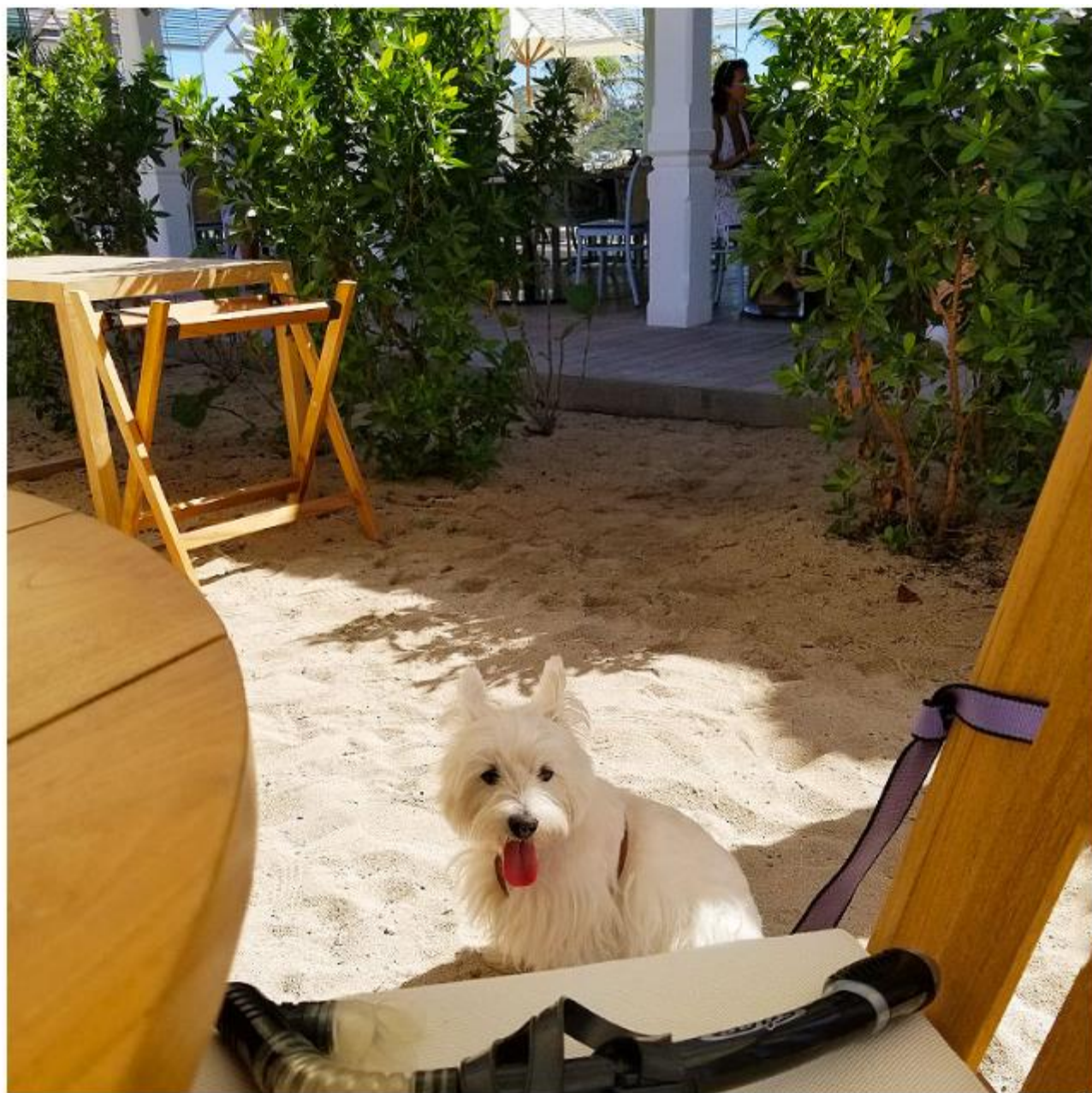
A paws-in-the-sand lunch.

We had lunch with our feet in the sand. Aggie joined us, of course. Grand Cul-de-Sac is full of huge sea turtles, and we snorkeled out to see them after lunch. I had a juicy burger and Aggie got the fries. We also taste-tested a cookie-like dessert, as the menu is still a work-in-progress. The food was very good.