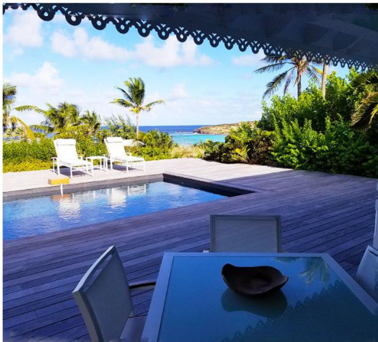
A quiet pool with a view.

The deck and the private pool are surrounded by lush plantings. The entire property is beautifully landscaped. There has been quite a bit of rain in the past year, and the island is extremely green.