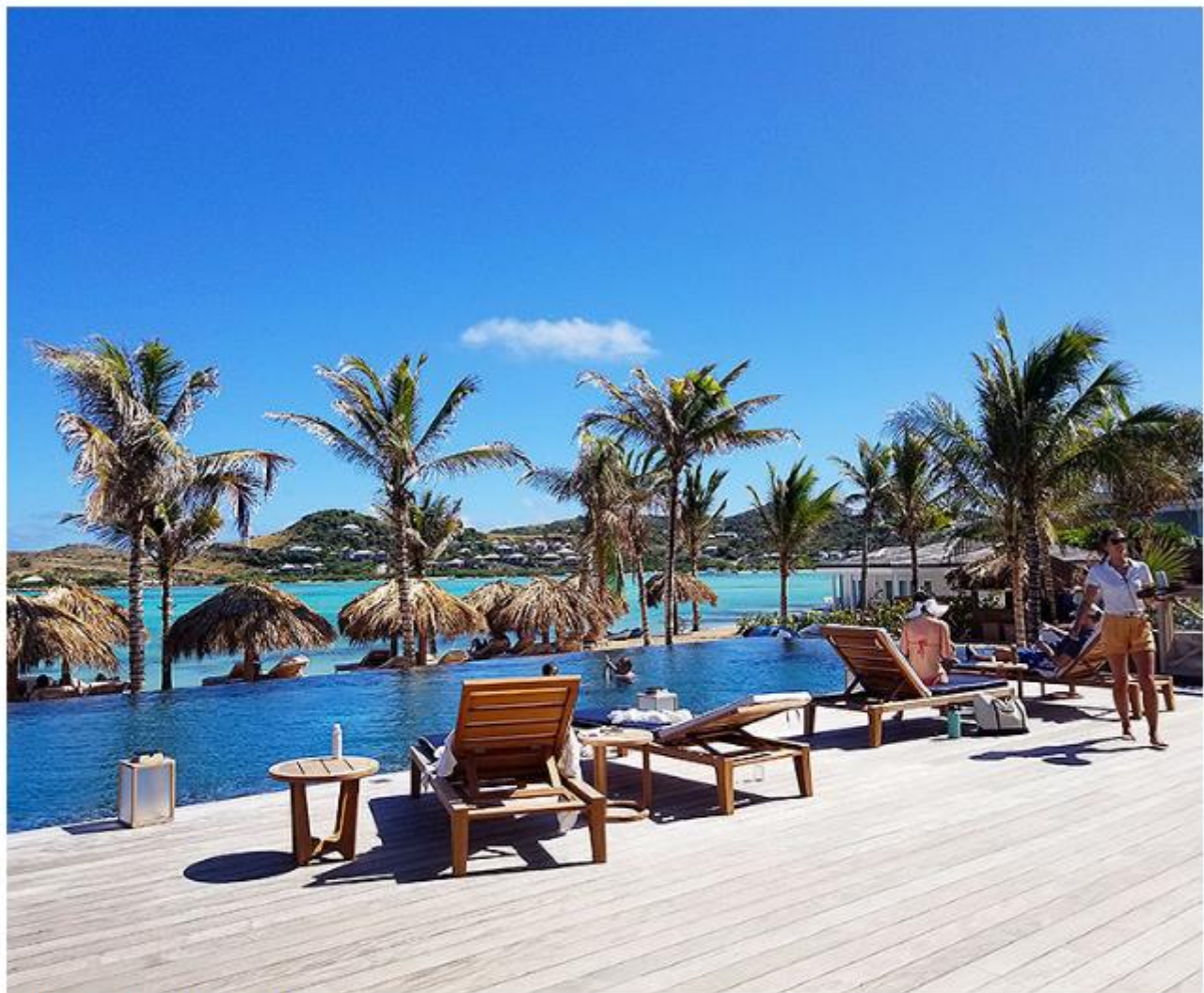
The pool at Beach House.

The Rosewood Le Guanahani reopened in mid-December 2021, four years after Irma left. It is the largest hotel on the island. The hotel was redesigned, but it kept much of its island style look. The main pool is located in the Beach House on the edge of the lagoon. Loungers are also on the beach below.