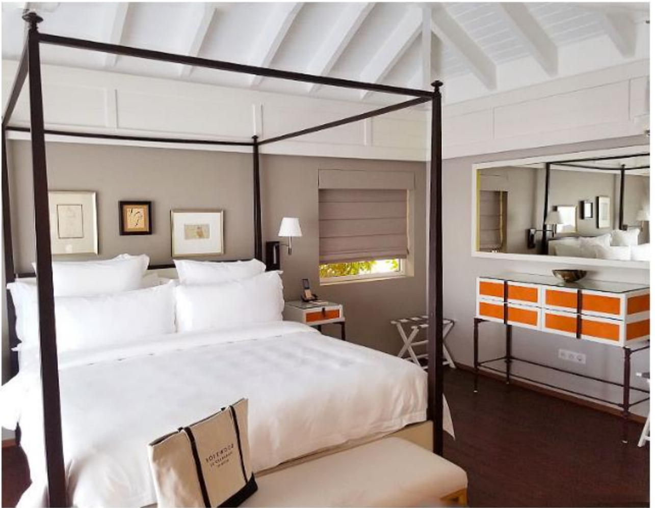
The suite's bedroom.

All the rooms and suites are built using the local St Barths case structure, and each room has its own peaked roof. All the buildings are single story, and everything feels a bit hidden and private.