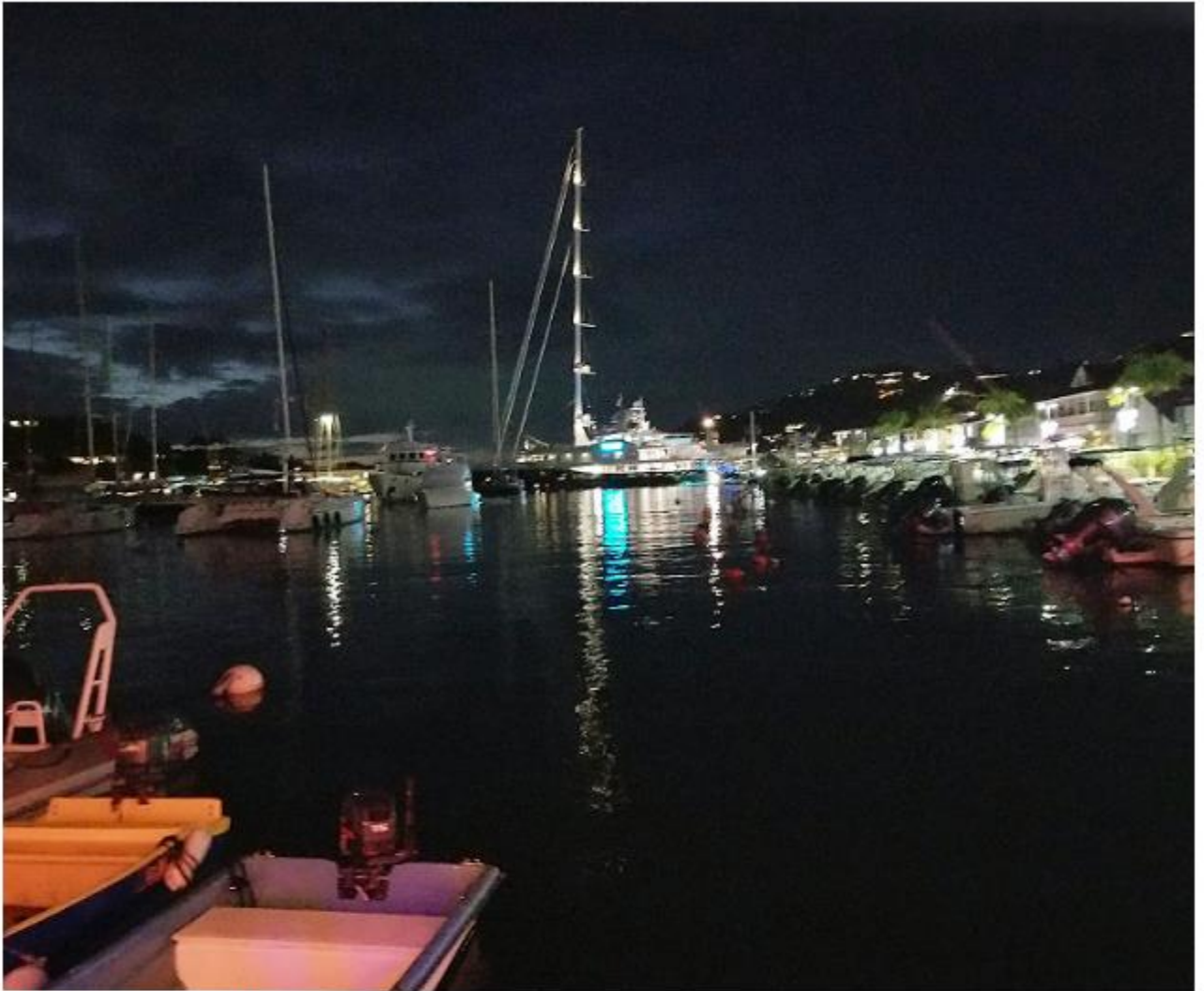
The harbor at night.