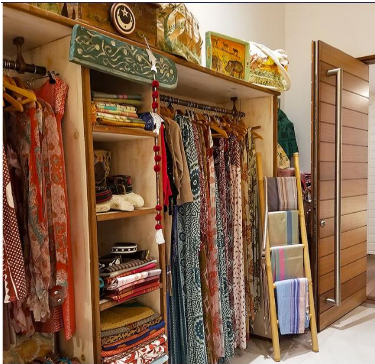
Gypsea boutique is full of Boho looks.

Gypsea , a haute Boho boutique, moved from Le Tamarin restaurant to a new location in town. Designed and owned by a local mother-daughter team, the merchandise is made in Africa with a French touch. There is a nice selection of jewelry using uncut precious and semi-precious stones.