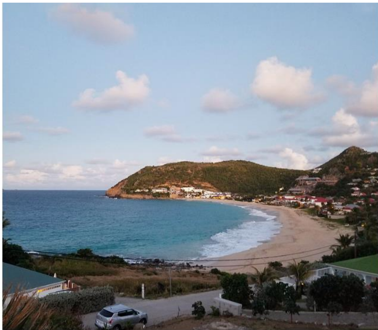
A late afternoon view of Flamands.

We got to our house, perched above Flamands, very late in the afternoon. The view was still picture perfect. We headed to town to pick up some food, and soon ran into a Covid novelty. The government had banned the sale of alcohol after 6 p.m. in grocery stores. On the bright side, the store was full of Christmas goodies like caviar and foie gras, although whole milk and fresh fruit were hard to find. After a long day, a simple BBQ was the answer, with some wine that our thoughtful host had left for us in the fridge.