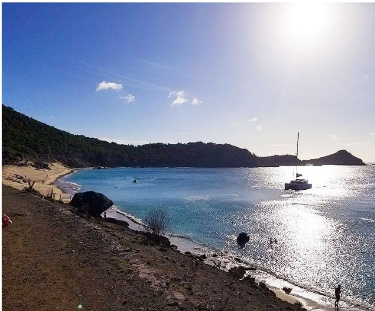
Columbier Beach late in the day.

Columbier is a beautiful and calm beach. It is often full of boats. The peninsula at the the back is the old Rockefeller estate now owned by Steve and Linda Horn . The beach is their private paradise.