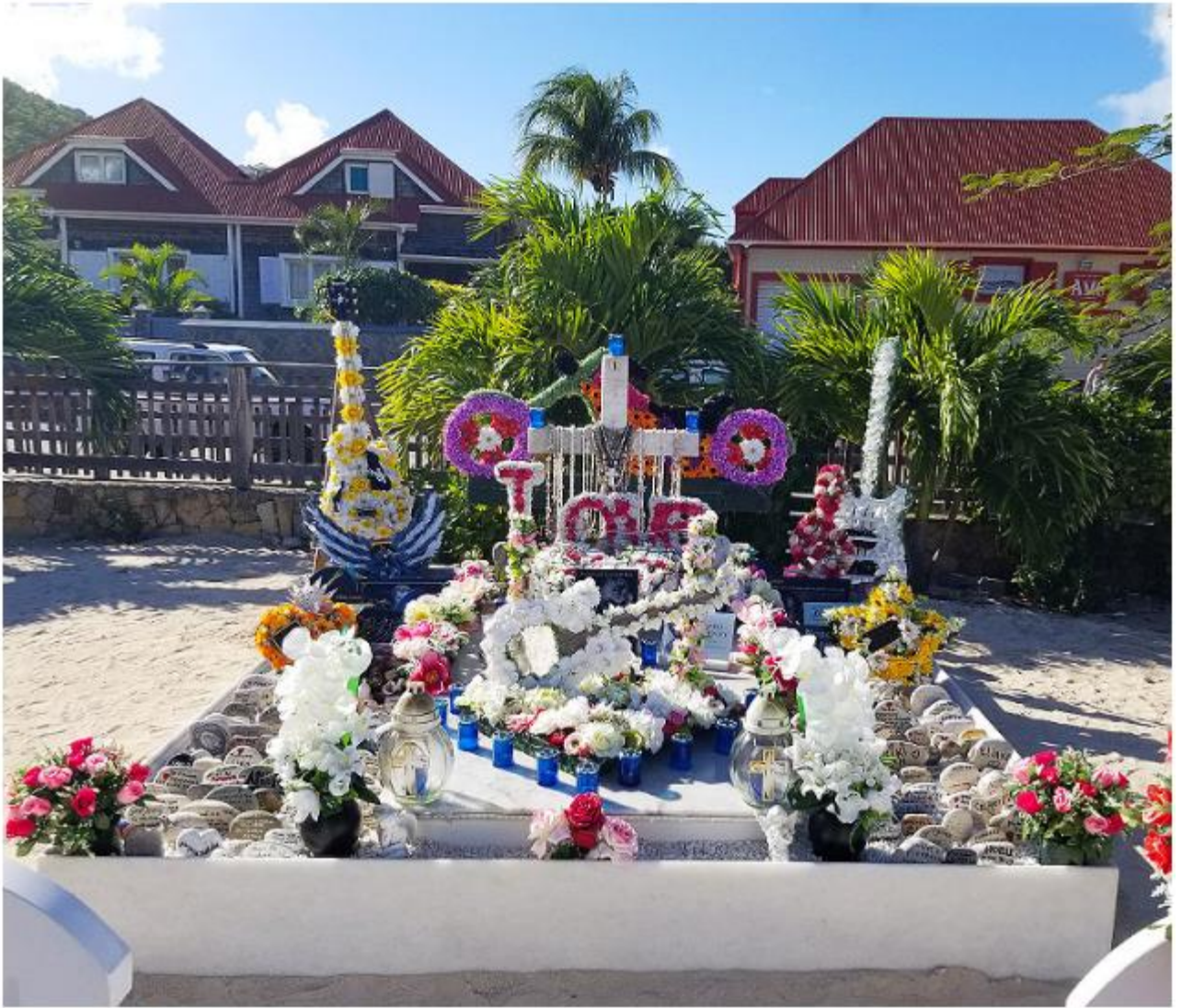
Johnny Hallyday's resting place.

I had never seen Johnny Hallyday's grave. The French rock star died in 2017, and fans flock to the cemetery in Orient to pay homage. Many wonder why he is buried here and not in France. Large rocks with messages of love line the sides, and guitars made of plastic flowers decorate the tomb. Johnny lived high above Marigot Bay in the huge, luxurious Villa Jade. The villa is for rent, and you too can enjoy an icon's lifestyle. An air conditioned gym, a home theater with 4,000 films, and views for days make it a special property.