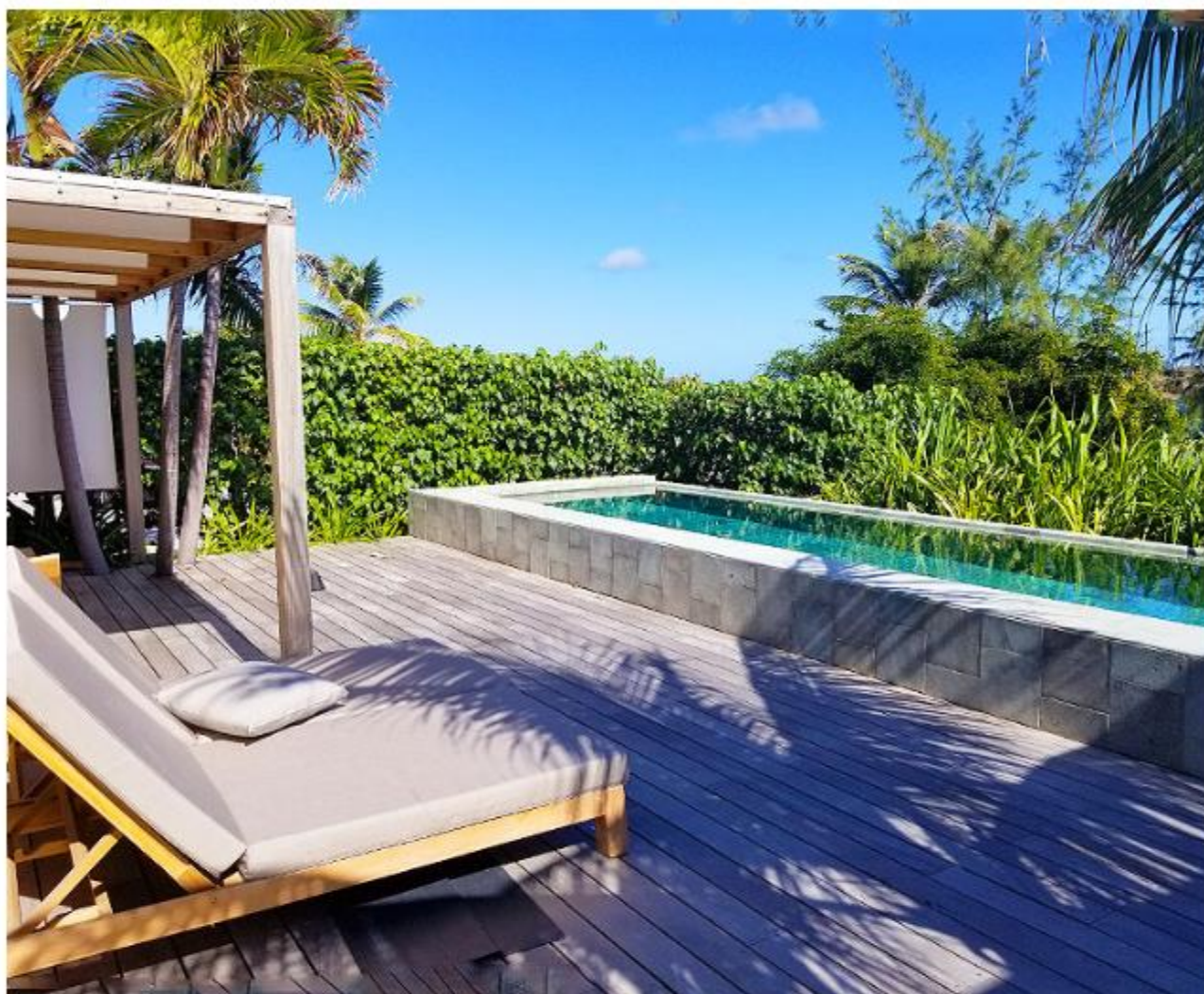
A private pool in the Suite Piscine.

The terrace has a small pool that mimics the main pool. Overlooking the beach, it can be combined with an adjacent bungalow with additional bedrooms. A private life made for families and friends.