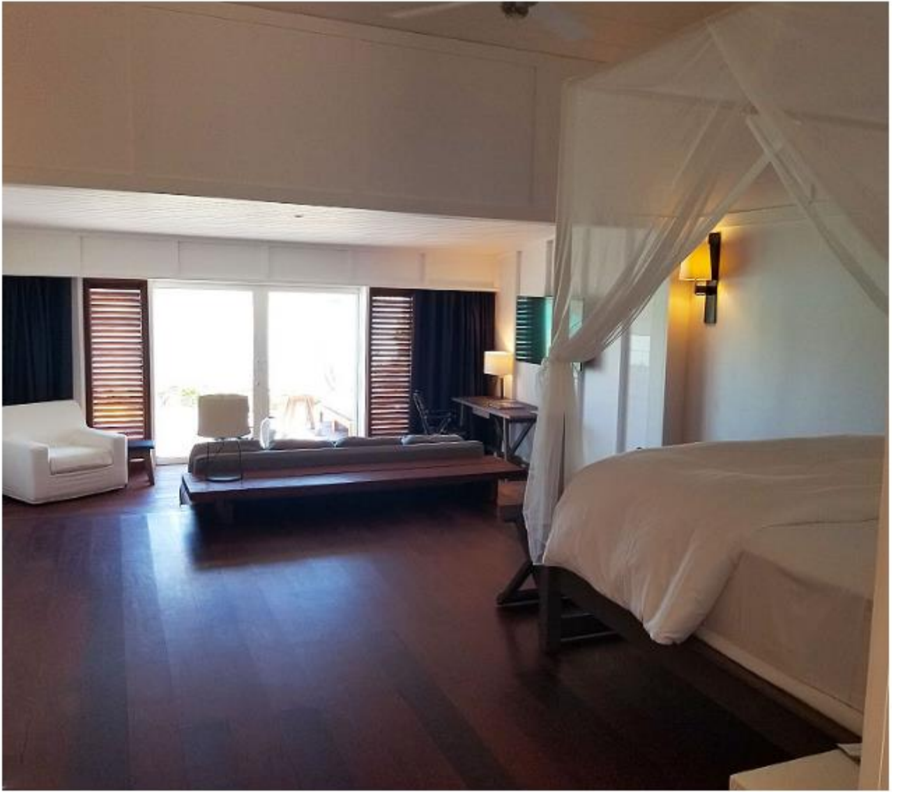
A suite with the Liagre touch.

At the other end of the property is a newly built configuration of rooms. Designed with Covid seclusion in mind. This large room opens out onto a private terrace overlooking Grand Cul-de-Sac.