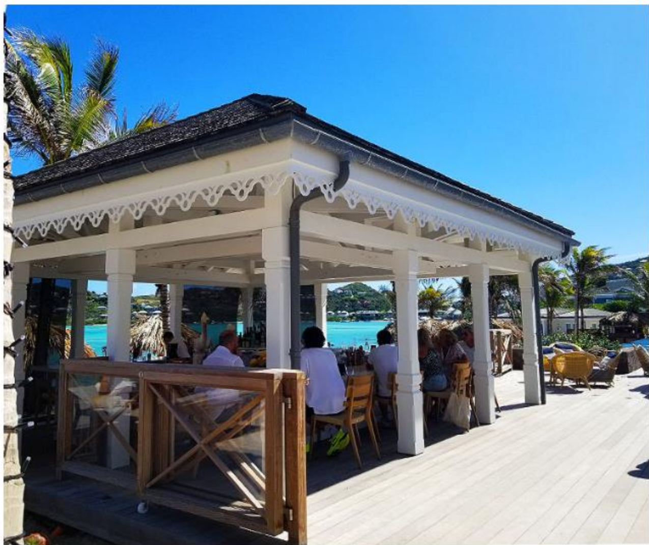
The poolside beach bar.

The Beach House has a bar, lounge, indoor and outdoor restaurants, and a beach bar with traditional St Barths gingerbread trim. The hotel has 66 rooms and suites, and more suites than rooms. And it was full.