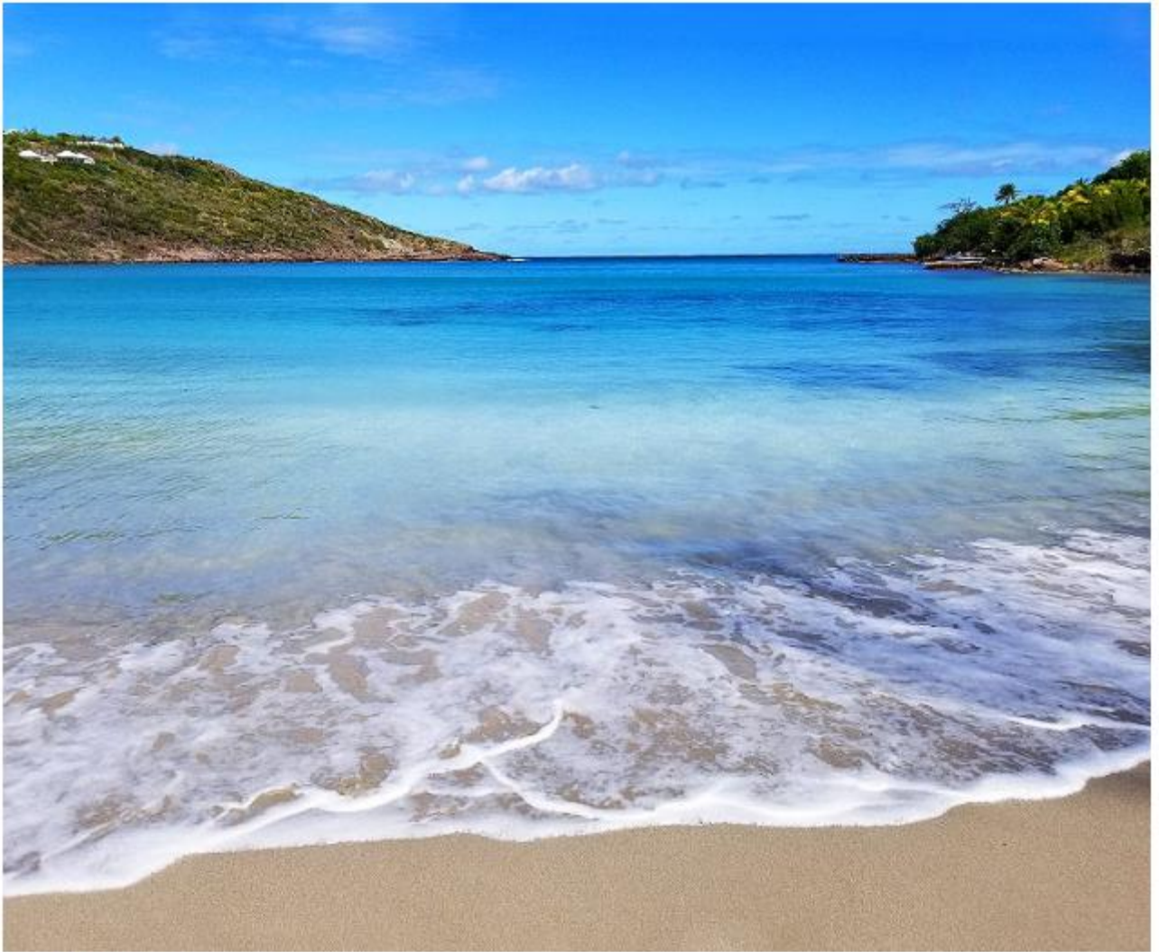
A calm morning at Marigot.

Last year Marigot was full of invasive sargassum. You could not swim in it. This year the disgusting bloom is mostly gone. This was once the best snorkeling beach on the island, but life was choked out of it. Some small fish and plants have started to come back. The swimming is delightful, and the beach is almost always empty. Hopefully the sea plant invaders will stay away from this beautiful destination.