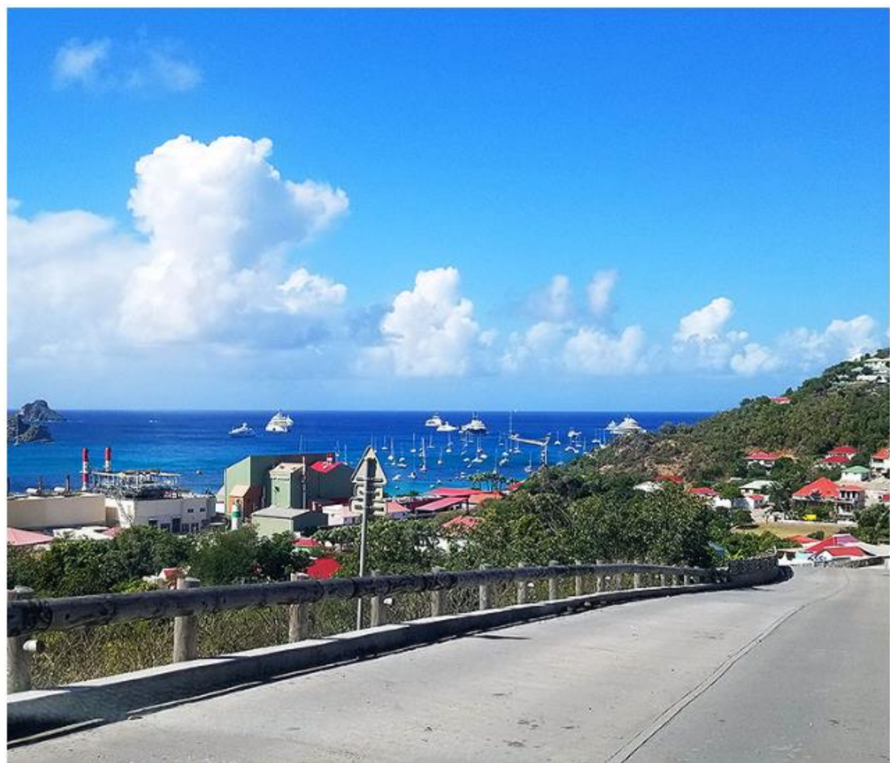
Some of the last Christmas yachts.

We love our house. It is compact, well designed and impeccably placed. The Collectivité, the local government, has been busy for the last few years making sure fiber optic wiring is being buried — meaning that overhead lines will start coming down. The Collectivité has also been protecting its green space. There are huge houses being built all over the island, and on the hillside on the right in the photograph above (they do spoil the view). Going forward there are strict limits on the size and height of new buildings. 66% of the island is currently “zone naturelle” or green space. The new laws will keep that space fixed, and focus on permits for houses that do not overwhelm the island. Respect for its natural beauty is needed — and appreciated.