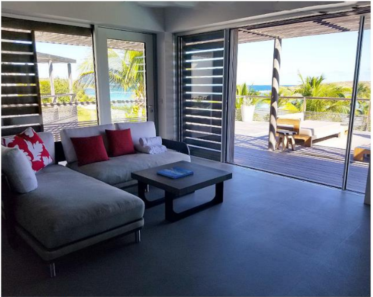
A corner of the living room.

The redone hotel was designed by the late Christian Liagre , he of impeccable taste. The villas consist of two buildings. The one out the window has some of the bedrooms. The main part of the villa overlooks the pool and the lagoon. It is all very low key luxe.