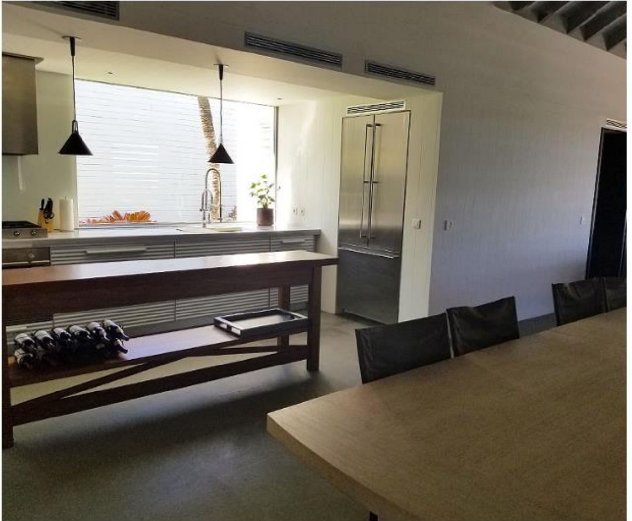
The streamlined dining area and kitchen.

The dining area and the kitchen are also super chic. Cook for yourself, order room service from Al Mare, the hotel restaurant, or have a private chef who will do all sorts of BBQs and festive dinners.