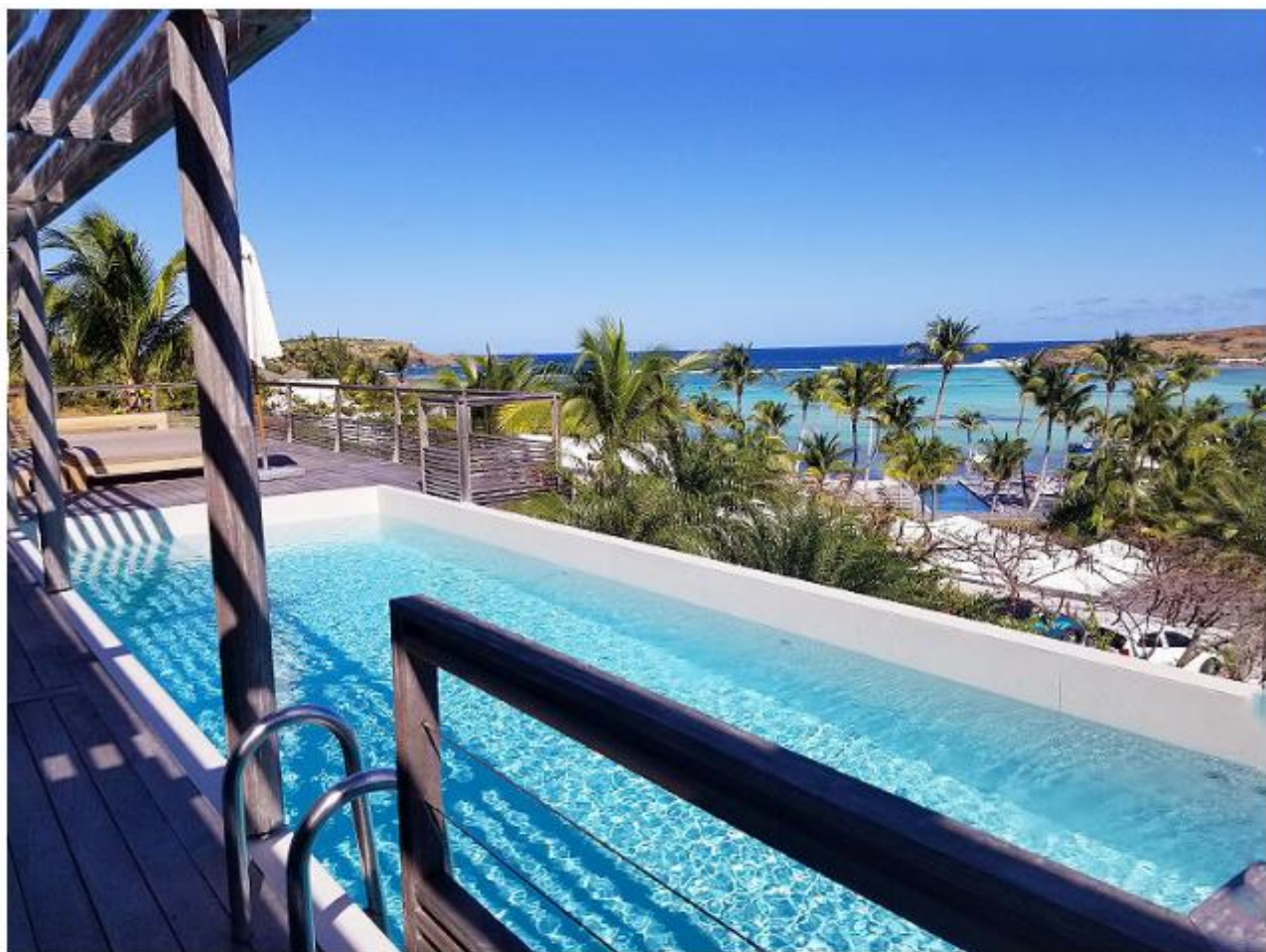
The villa pool above the beach.

Hurricane Irma devastated St Barths in 2017. Le Sereno was one of the many hotels destroyed. It built back better, with a chic new look, and many new additions. There are now three private three-bedroom villas that sit at the top of the hill overlooking Grand Cul-de-Sac. The library can become a bedroom, too.