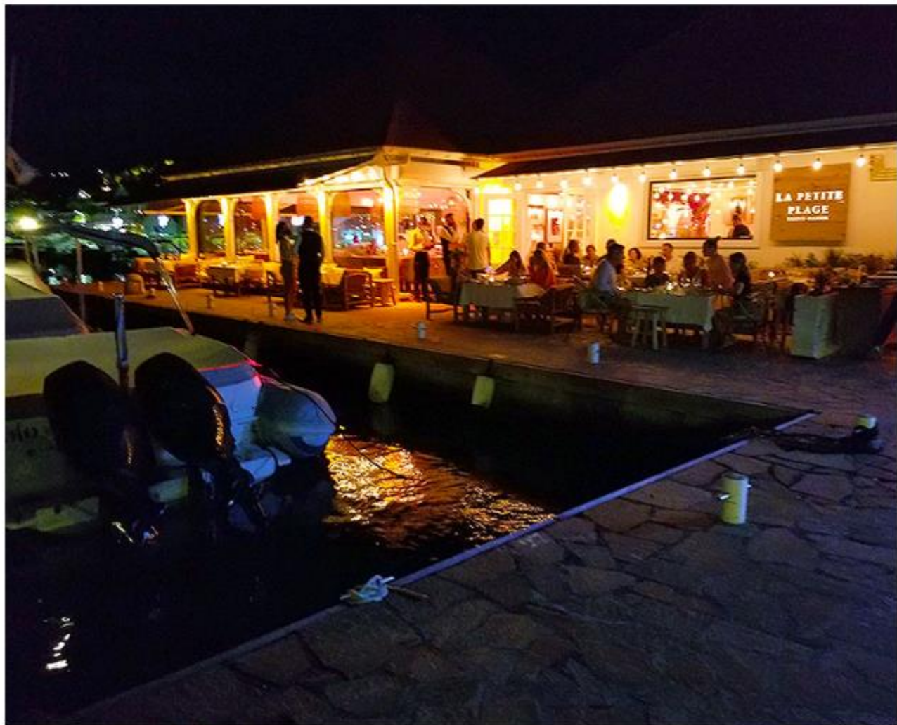
La Petite Plage on the harbor.

Le Petite Plage is a hot new restaurant and is the sister to restaurants in St. Tropez and Biarritz, owned by Michelin starred chef Eric Frechon . Families dine early, and later in the night the music cranks up so the guests can party. The two discos on the island are temporarily closed, so people let loose here.