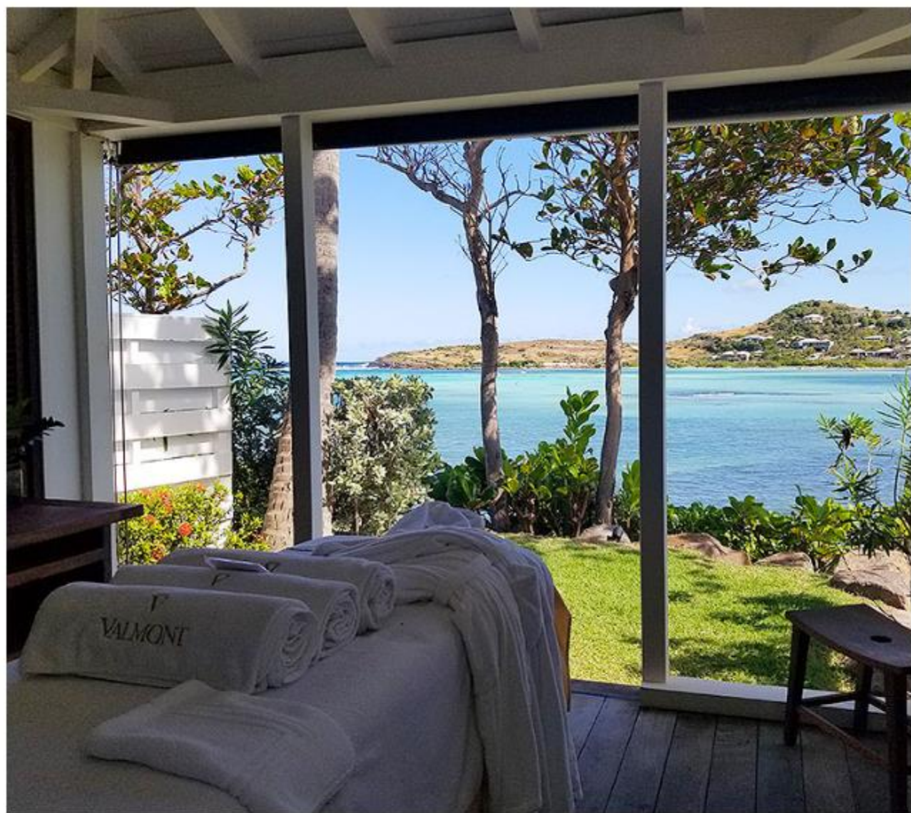
Treatments with a view.

Also on Grand Cul-de-Sac is the spa. One of the private treatment rooms opens to the ocean. A large gym is nearby. You can also get treatments in your room or suite.