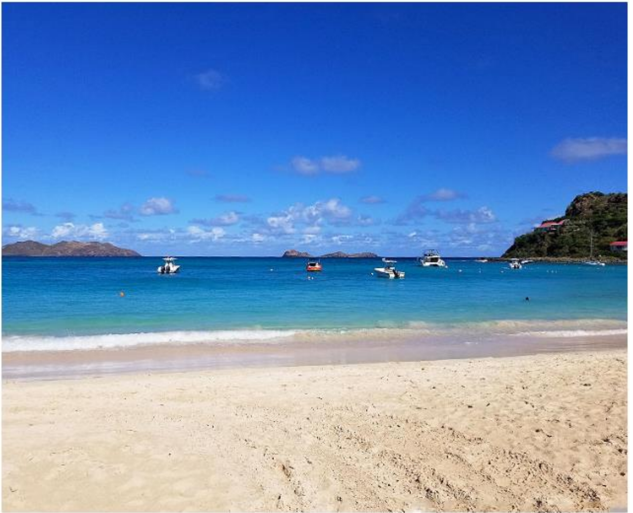
Ti St Jean in the morning.

Pelican Beach or Ti St Jean, as it is now known, is on the right side of Eden Rock. It is a bathtub beach, and is quiet and empty in the morning. The beach is home to two beach clubs, Nikki Beach and the new Gyp Sea. The water can be full of people bobbing with glasses of rose in hand in the late afternoon.