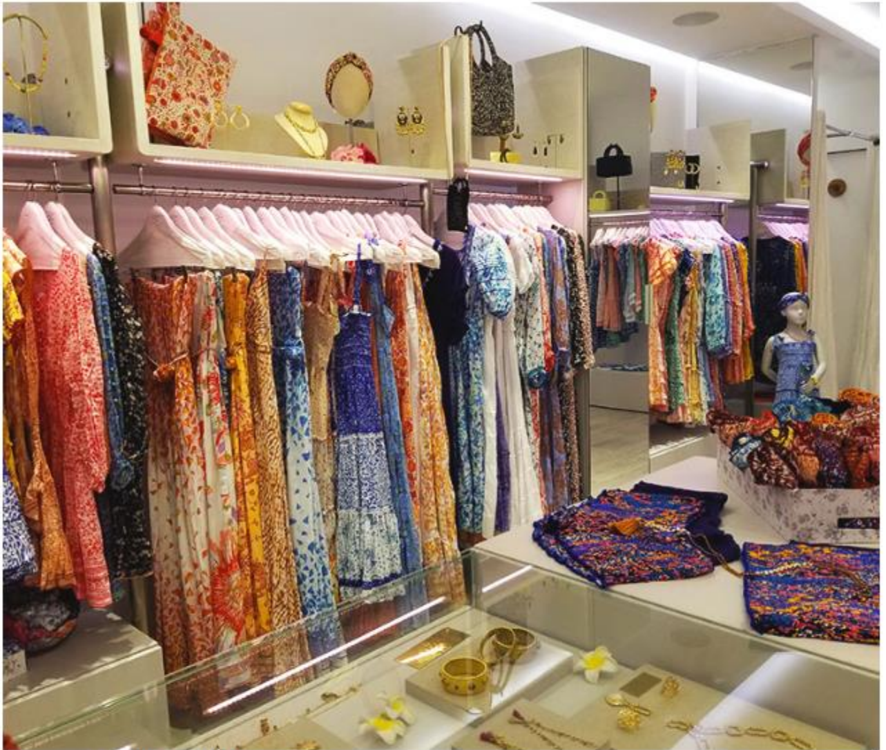
Poupette St Barth is full of prints.

Poupette St Barth is now open in St Barths with a large collection of clothing for women and girls. Jewelry and accessories lend island chic to your look. The brand already had stores in the Hamptons.