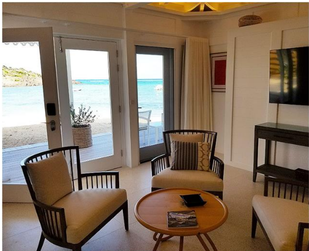
A view from the Lagoon Suite.

The Lagoon Suite, located very close to Beach House, is a beachfront suite steps away from the lagoon. The hotel's decor was done by Luis Pons , and is very contemporary with a clean vintage feel.