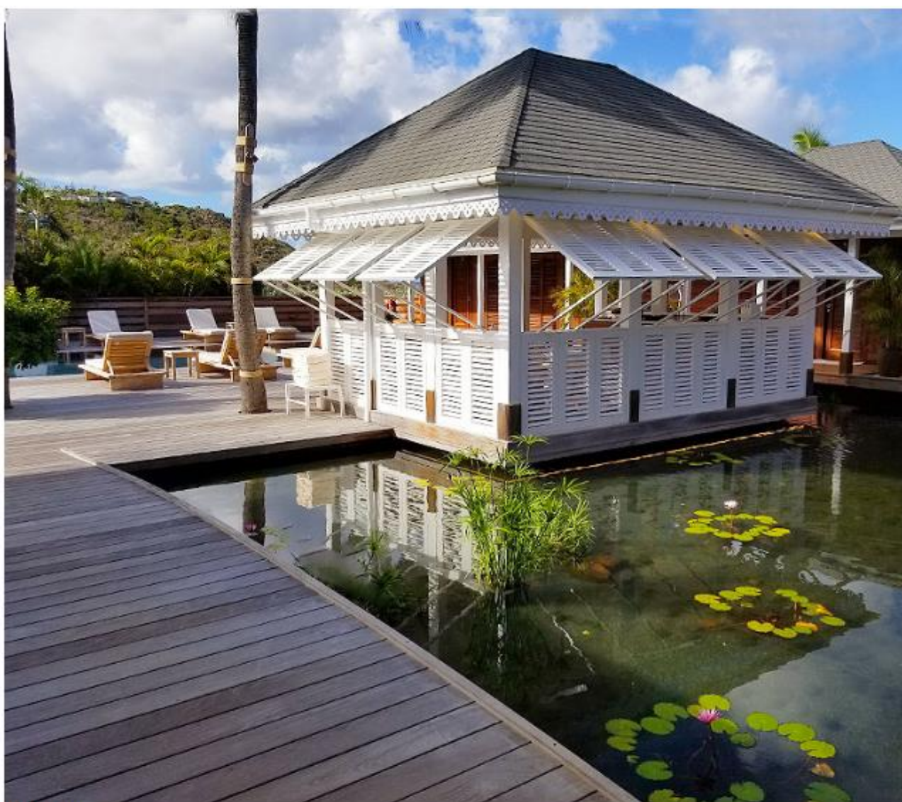
Inside the spa.

The Sense Spa is in a large complex. Along with treatment rooms, there is a full gym and a quiet adults-only pool. Refreshments are served in the bungalow on the tranquil pond. Guanahani is very family friendly. Near the spa is the Rosewood Explorers, an indoor and outdoor space for children with games and activities. Babysitting can also be arranged.