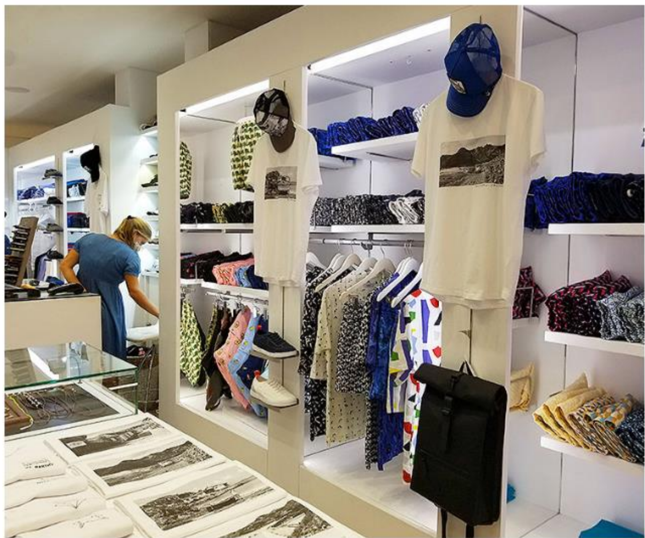
Sunbarth for men.

Down the street is Sunbarth for men. The clothing is modern and functional. I love the tee shirts and hats printed with vintage photos of the island, the airport, Eden Rock, Gustavia and other views. Linen pants, shirts, swim trunks and more. All designed for the easy island life.