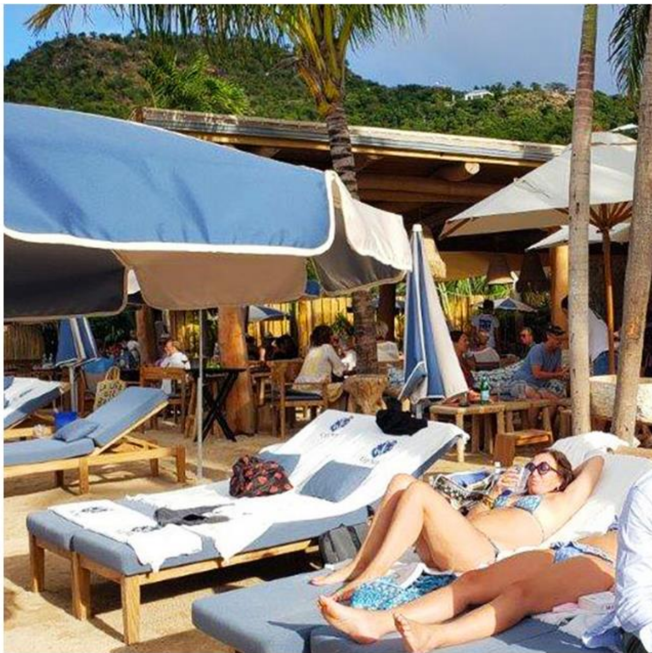
A lazy day at Gyp Sea.

Gyp Sea is the newest addition. Created by the owner of the Villa Marie hotel in Columbiér, it shares its name with the Gypsea boutique in Gustavia (whose owner regrets she did not trademark the name for restaurants). Both celebrate the gypset lifestyle. Choose from many grilled delicacies for lunch. Rent a matelassé and spend the day overlooking the calm beach, with music rocking the afternoon.