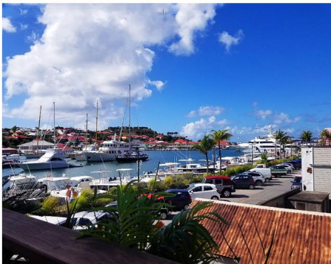
The harbor view from L'Atelier Joel Robuchon.

Monday we had lunch at the new L'Atelier Joel Robuchon . There is a dining room and counter downstairs, and a wide open beautiful terrace upstairs. The view is dreamy. Of course the food is perfect. I still had langouste on the brain, and ordered a delicious Spaghettis aux langoustes. Deserts rock, too. There is also a lovely space at the back of the building for special breakfasts and tea.