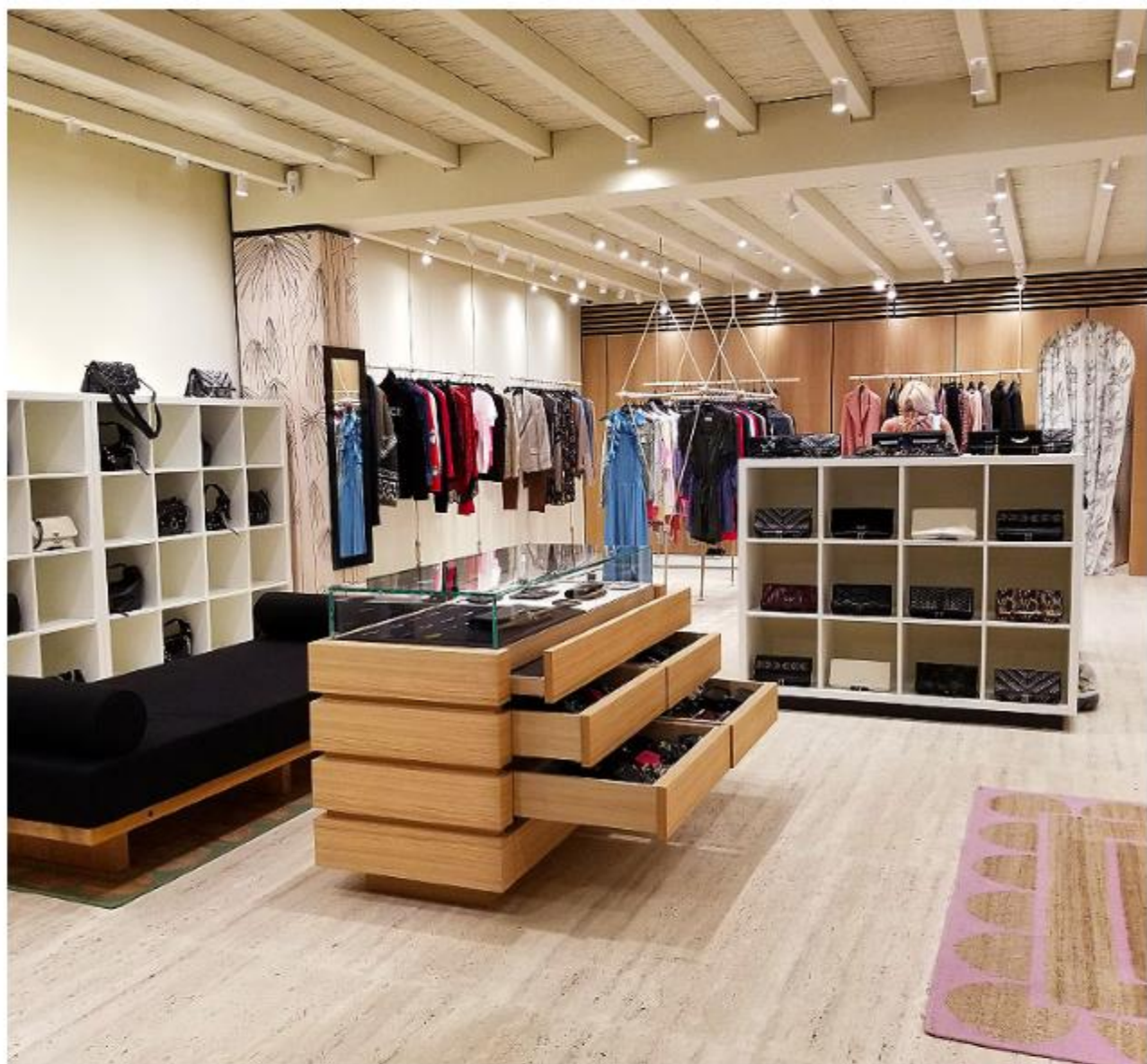
Inside Zadig and Voltaire.

If you are not into gypset prints, Zadig and Voltaire offers a cleaner contemporary look with a rock attitude. And this boutique also offers a men's collection.