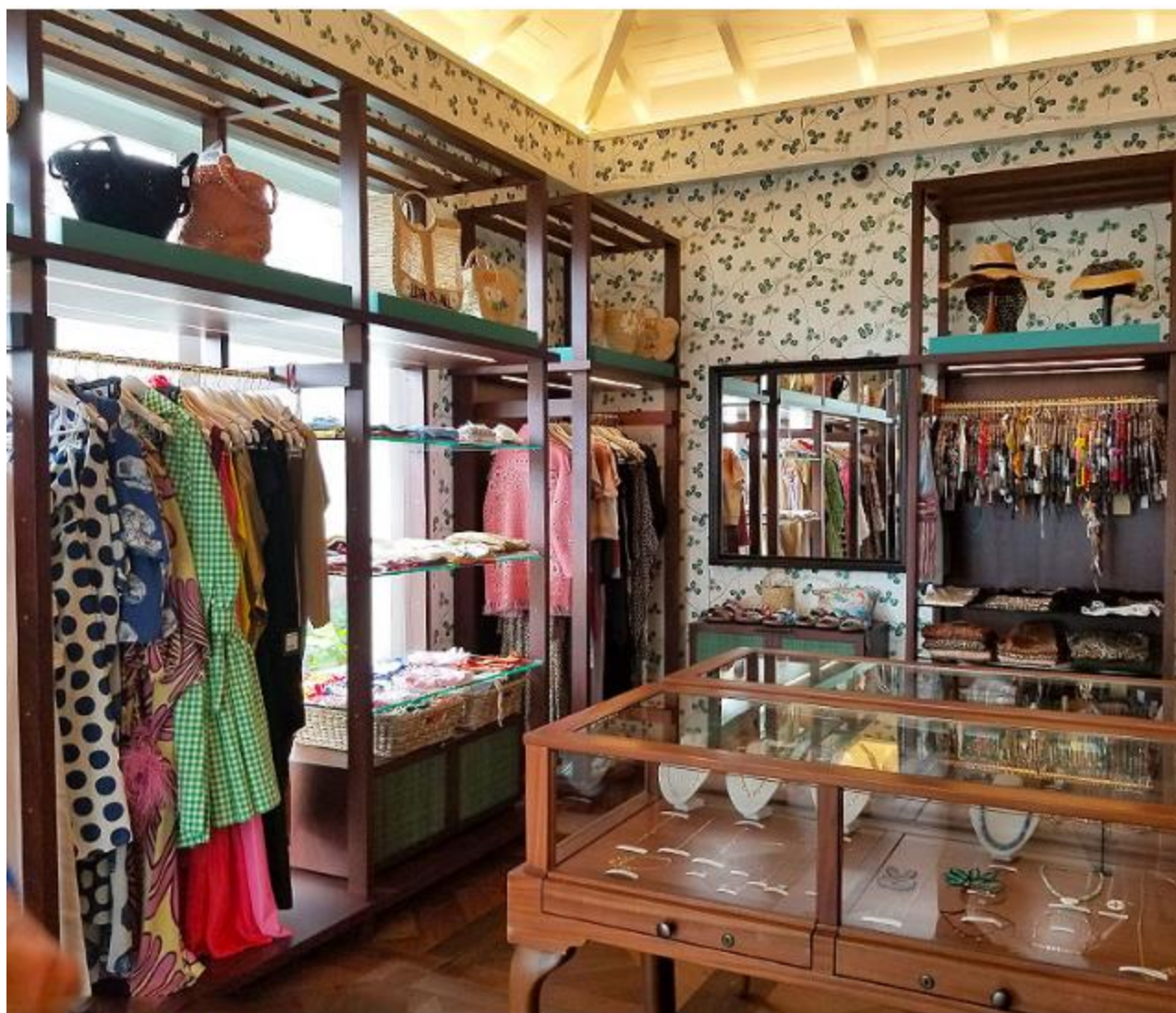
Inside La Boutique.

La Boutique is located in the Beach House. The clothing and accessories for men, women and children are carefully chosen. Raquel Allegra and Norma Kamali from the States and American Retro and Alanui are some of the women's brands. And yes, there are mohair sweaters here too. La Boutique is also doing pop-ups with selected designers on an ongoing basis. Next up is Pompom Paris from Lola Rykiel.