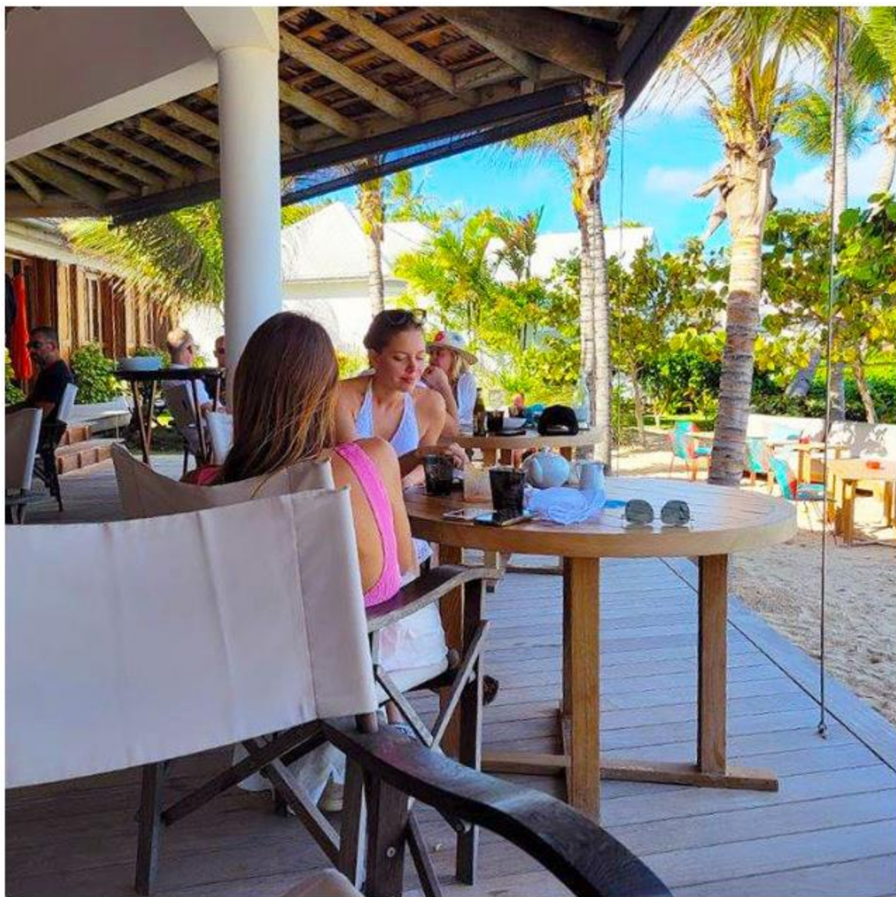
A beachside lunch.

Al Mare is the stylish beachside restaurant. The food and most of the waiters are Italian. I had another lovely spaghetti con aragosta. Perhaps repetitive, but I cannot get that in New York. There are tables on the beach, and a lounge and bar area. Italian food and sunny days and starlit nights go well together.