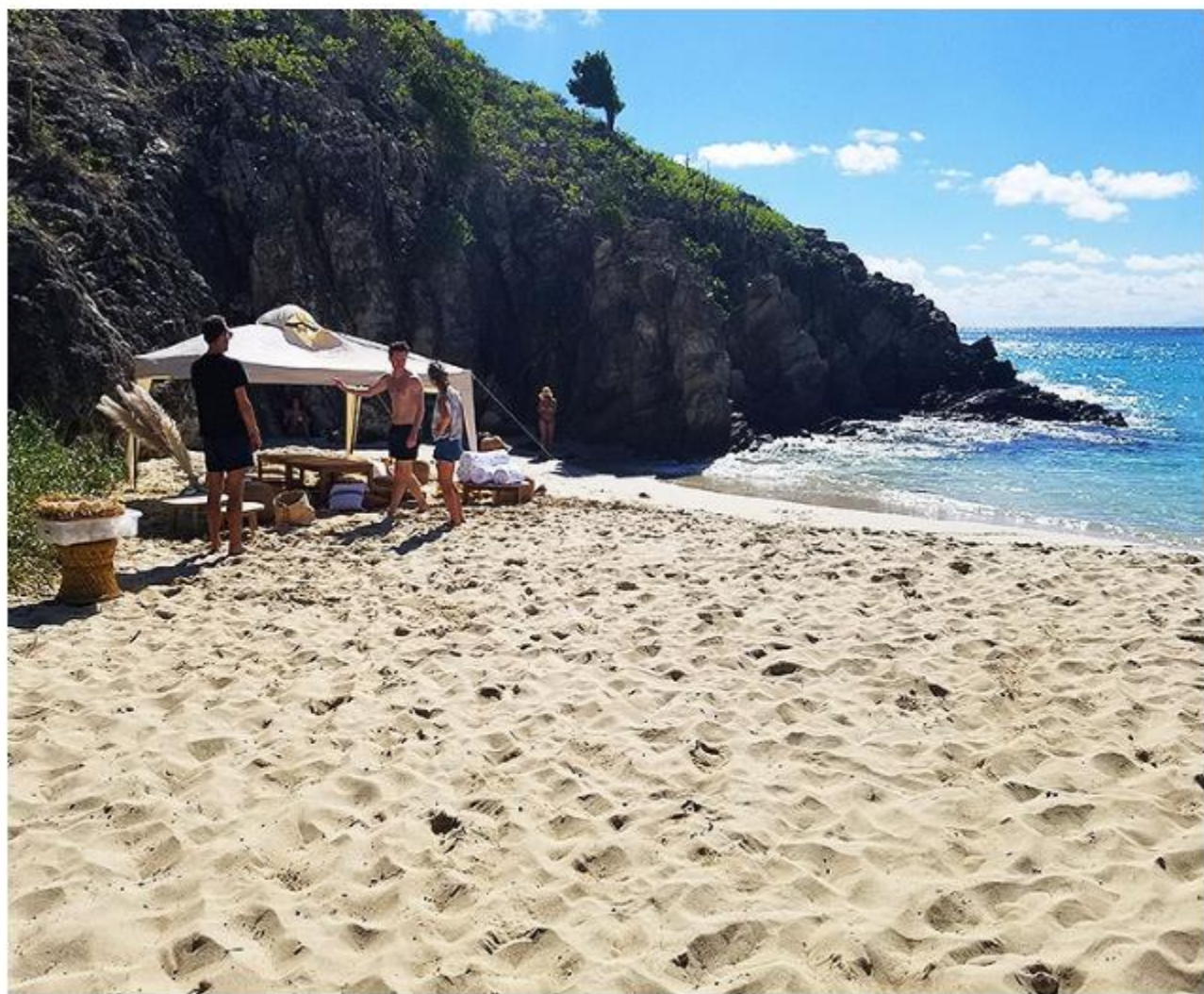
Bring your own tent.

The next morning we headed to one of our favorite beaches. A must-use website and app is windy.com for St Barths. The app was developed for boaters, but can easily tell you which side of the island will have less wind and calmer beaches. Another fun website is Marinetracker.com . You can locate all the super yachts, and many of them were in St Barths over the holiday. 305 boats were anchored, 127 of them were more than 40 meters, and seven of them were 90 meters or longer. On the 31st, there were more than 5,000 people celebrating on boats. While many yachts had moved on, a few BIG boats were still hanging around.