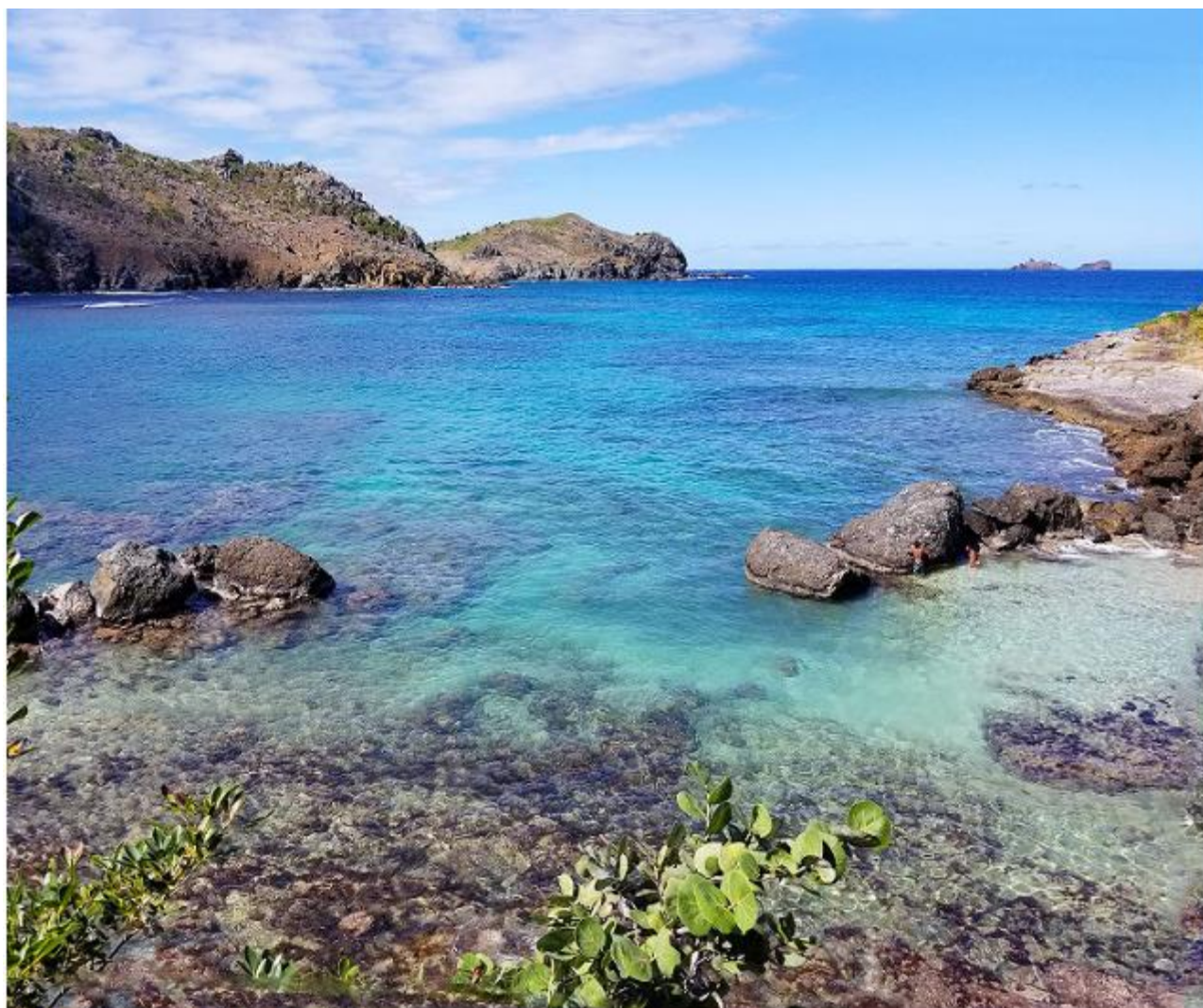
On the way to Columbier.

La Langouste is located in the small Baie des Anges Hotel on Flamands beach. The restaurant is set next to the hotel's pool. A large tank full of langoustes, the local spiny Caribbean lobster, is located at the back near the kitchen. They are grilled to perfection, and are beyond delicious. If langouste is not your thing, there is a full menu with French and Creole specialities.