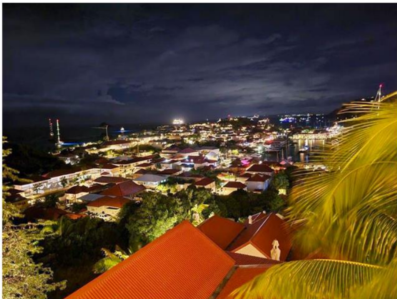
The harbor view at Le Fouquet's.

We were headed to dinner at Fouquet's in the l'Hôtel Barrière Le Carl Gustaf. Pierre Gagnaire created the menus and dinner was delicious. We shared a huge duck with an orange sauce. The duck legs were made into a confit samosa. The hotel sits above the harbour and the view is pretty spectacular.