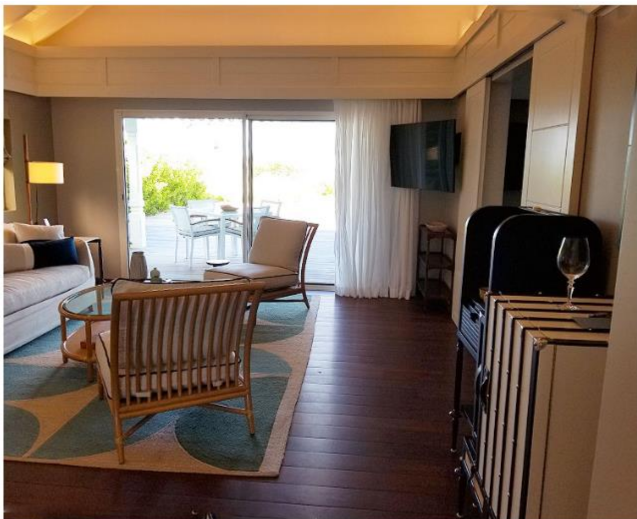
The vintage living room.

This Pool Suite is located at the top of the property overlooking the lagoon. What resembles luggage on the right is actually the minibar cleverly disguised. The living room and the bedroom open to the terrace.