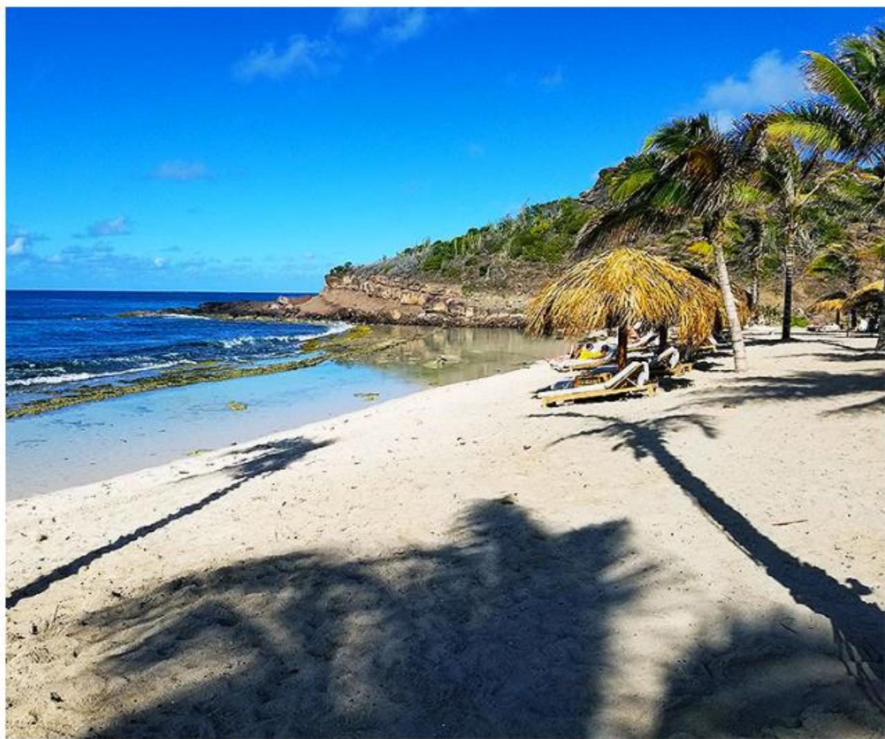
Relaxing on Marechal Beach.

The hotel sits on a peninsula between Anse de Marechal and Grand Cul-de-Sac. Marechal is one of my favorite deserted beaches. In France, all beaches must have public access, and you can go through Guanahani to get to Marechal. The hotel purchased the peninsula during the renovation, and added shade and loungers. Kayaks, paddleboards and snorkeling equipment are available for guests.