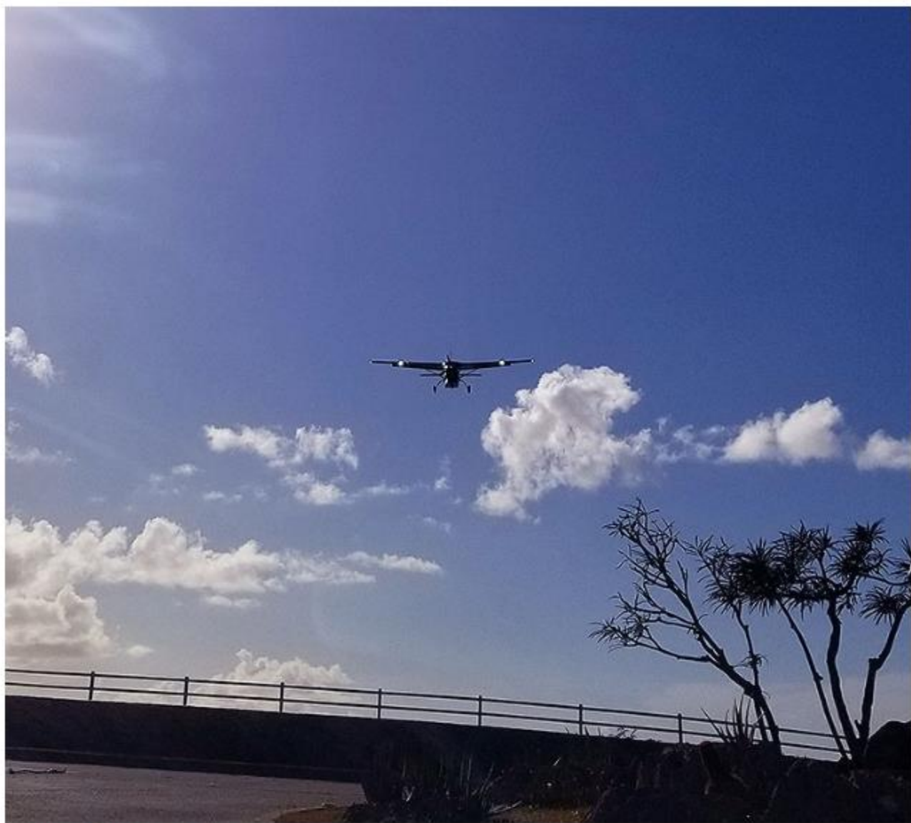
Approaching the airport.

The island was pretty much fully booked. There were flights landing all day as most people arrive by plane, scheduled or chartered (private jets are not allowed on the island). The planes normally come down right over one of the main roads and more than a few times a low landing plane has swiped the roofs of cars on the road.