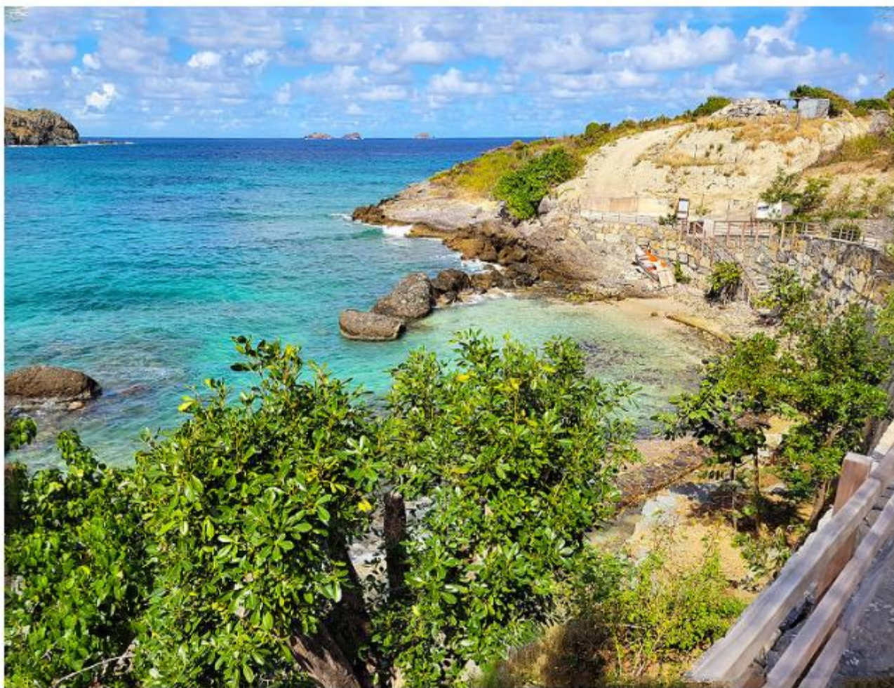
The newly refurbished Petit Anse.

Our house had two beaches a very short walk away. Flamands is dramatic, but Le Petit Anse is a snorkeling paradise. An access road and steps down to the beach were added recently. Local kids learn to swim in the shallow area. When the wind is right you swim out past the rocks and you are in a world of rocks, coral and creatures of the sea. Much of the time you have the beach to yourself.