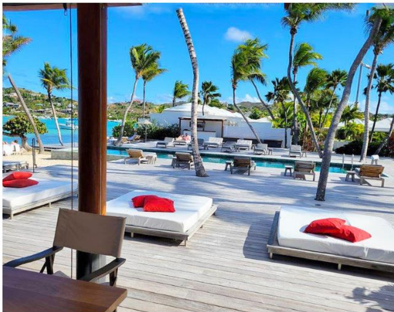
Relaxing at the main pool.

The pool sits on the beach adjacent to the restaurant. There are kayaks and paddleboards available. Grand Cul-de-Sac is known for its kite surfing. When the winds are right, you can hit the water and fly.