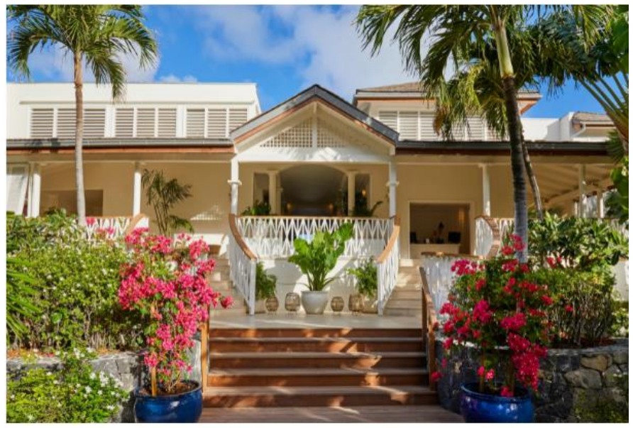
Cheval Blanc St-Barth Isle de France.

There's this phenomenon called Stendhal syndrome, when one feels a sense of shock when faced with great aesthetic beauty. That's what it feels like to enter into the <u>Cheval Blanc in St Barths</u>, a LVMH-owned hotel that exudes French Rivieraesque glamour. Tropical greenery and flora enshrouds each walkway, and walls are adorned in bougainvillea arches. The pink-and-white adorned beach club somehow manages to be social yet still relaxing—sure, you can order a bottle of magnum Whispering Angel to your cabana, or you could just as easily nap on your day bed. The rooms, dotted with pops of turquoise and globally sourced art, exude a warm, tropical feel that doesn't feel cheesy. Then there's the infinity pool: It's hard to know where it stops and the Caribbean begins.